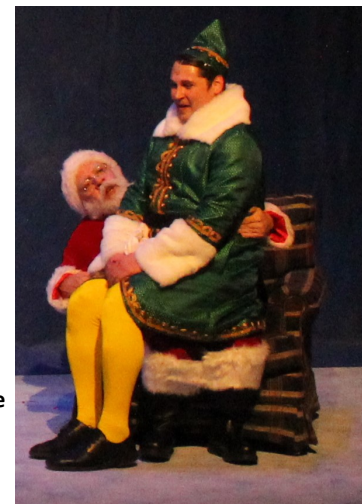
Fort Wayne Civic Theatre ELF 2018