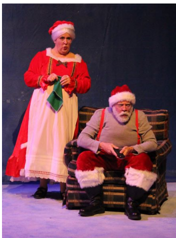
Fort Wayne Civic Theatre ELF 2018

Mrs. Claus, Elves, Charlie, Shawanda, Mr. Narwhal, Teenager, Employees, Security Guard 1&2, Customer 1&2, Saleswoman, Store Elf 1&2, Fake Santa 1, 2, & 3, Boy, Mother, Policeman 1&2, Sarah, Jim, Vendor, Waitress, Charlotte, Man, Woman