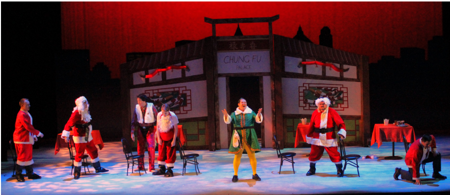
Fort Wayne Civic Theatre ELF 2018