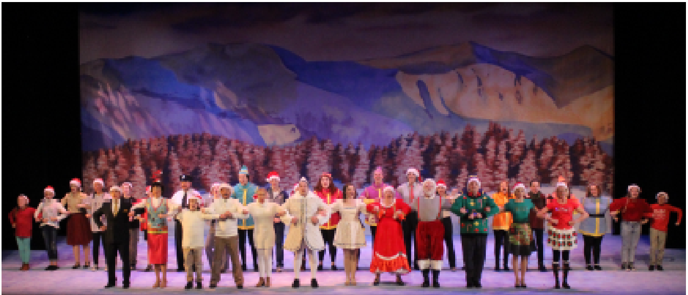
Fort Wayne Civic Theatre ELF 2018