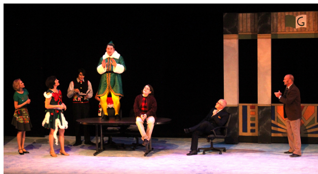
Fort Wayne Civic Theatre ELF 2018

When Emily and Michael find Buddy's note, they are deeply saddened. Emily tells Michael that, although she loves him, Buddy is crazy for believing in Santa at thirty years of age. Just then, Santa's sleigh flies through the sky and makes a renewed believer out of both of them ("There Is a Santa Claus").