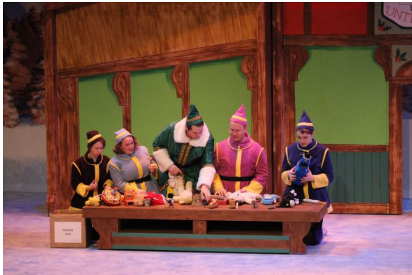
Fort Wayne Civic Theatre ELF 2018

Note: Subsequent productions including the Broadway revival and West End production replaced "Christmastown" with "Happy All the Time" and "I'll Believe in You (Reprise)" with "World's Greatest Dad (Reprise)"